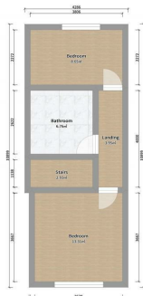
Sellywood Second Floor